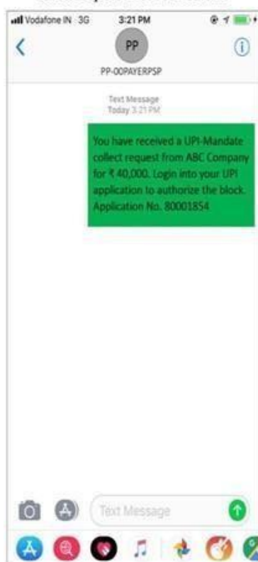
Block request SMS to investor